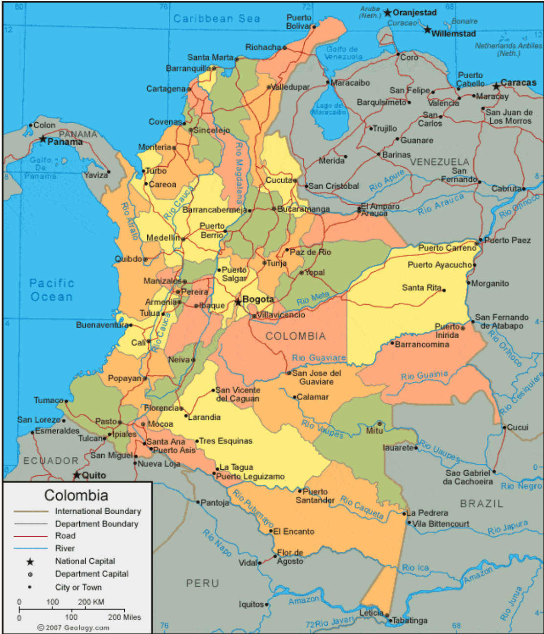
Available online at https://geology.com/world/colombia-satellite-image.shtml